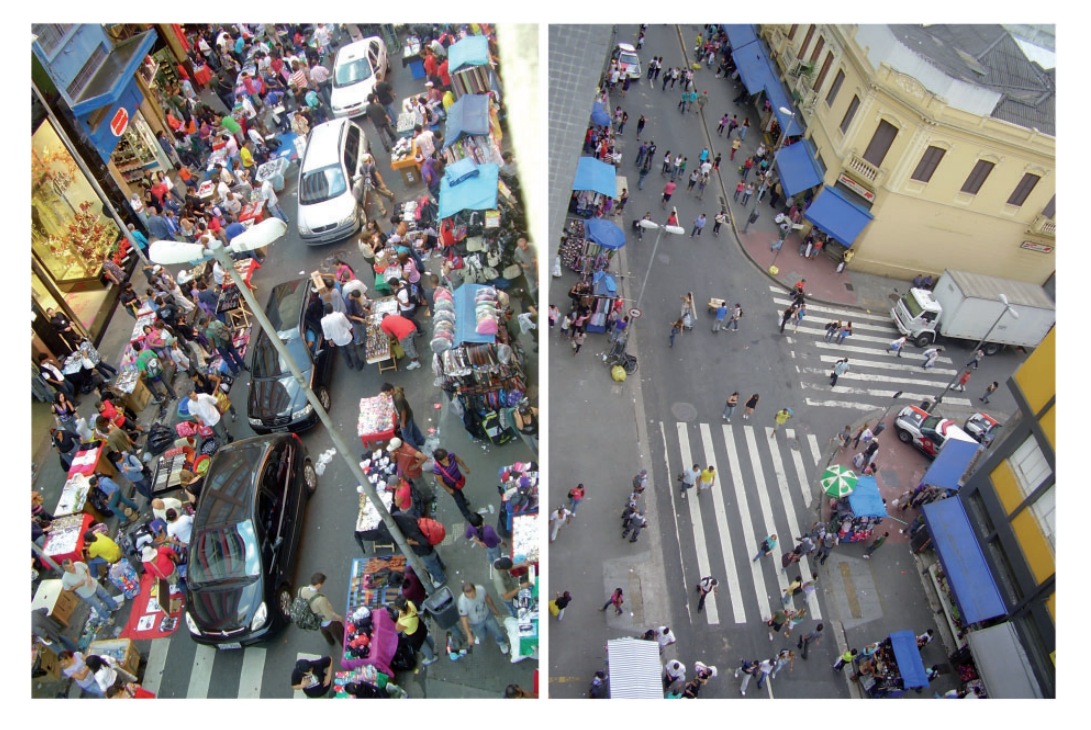
Figure 2. The 25 De Marco Before and After Military Police Intervention

Notes : São Paulo's main commercial street, the 25 de Março, before (left) and after (right) the deployment of the military police to patrol street vending in October 2009. Licensed street vendors can be identified by the plastic tarps covering their stalls. The three cars in the right-hand picture are police cars; unlicensed peddlers have all but vanished.